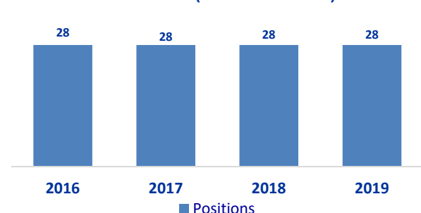
Personnel (FY 2016 - 2019)