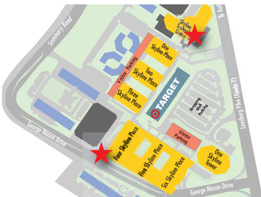
SKYLINE METRO SHUTTLE BUS STOP