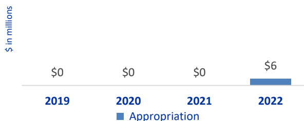
Personnel (FY 2019 - 2022)