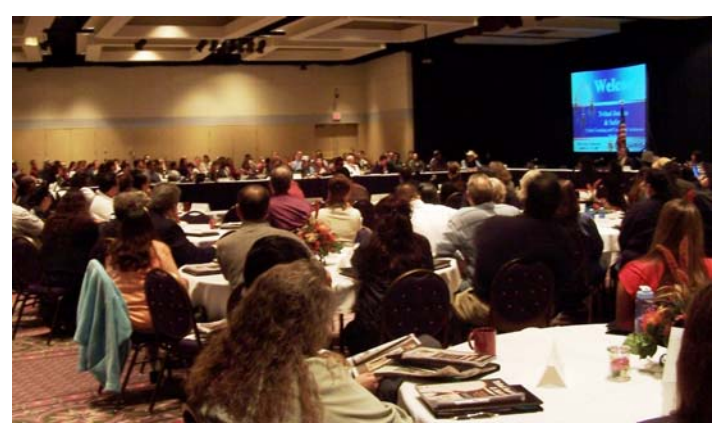
Tribal Consultation Session - Prior Lake, MN

Health Services Administration (SAMHSA), U.S. Department of Health and Human Services and the Bureau of Indian Affairs, U.S. Department of the Interior, held the second of four scheduled tribal training and technical assistance sessions on March 27 – 29, 2007 in Prior Lake, Minnesota. Sessions were held at the Mystic Lake Casino, which is on the Shakopee-Mdewakanton Sioux Tribe.