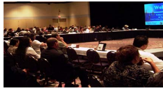
Tribal Consultation, Prior Lake, MN