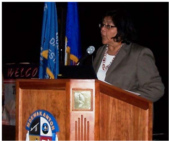
Welcoming Remarks: Cecilia Fire Thunder