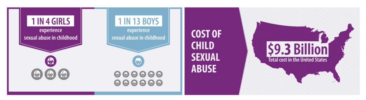
Centers for Disease Control and Prevention, Preventing Child Sexual Abuse

According to the Centers for Disease Control and Prevention (CDC), approximately 1 in 4 girls and 1 in 13 boys experience sexual abuse at some point during childhood. NCMEC statistics also reflect increasing volumes of child sexual exploitation. Between 2020 and 2021, reports of potential child sexual exploitation to the National Center for Missing & Exploited Children's (NCMEC) CyberTipline increased by 35%.