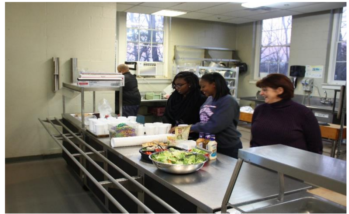
Preparing for residents of Covenant House Georgia to enter the cafeteria for dinner.

Prepare and Share a Meal. In our 3 rd year of participation in this program, the USAO-NDGA partnered with Covenant House Georgia to host and prepare nine dinners for the young people (aged 18-21 years old) living at the crisis shelter. USAO personnel donated money and volunteered to prepare the hot meals for the homeless and at-risk youth population at Covenant House. After preparing the meal, we also ate dinner with the residents and engaged in conversation about their career aspirations, hobbies, and hopes for the future.