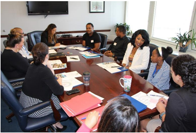
Formerly incarcerated individuals meet with the U.S. Attorney's Office regarding contract regulations.

Contracting with Returning Citizens. For the first time, the USAO-NDGA received funding to engage certain formerly incarcerated individuals as independent contractors who had previously partnered as volunteer speakers for the Real Talk program and various reentry forums. Initially, the USAO secured approval to provide five of these speakers with a small reimbursement stipend for speaking and mileage. By the end of the year, eight formerly incarcerated individuals were engaged as independent contractors.