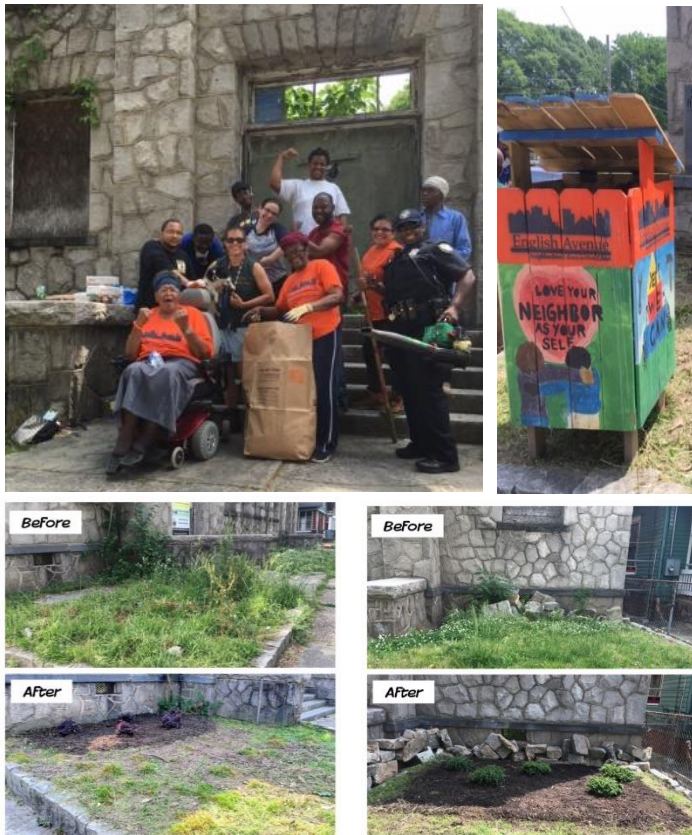
Residents, law enforcement, service providers, and an Assistant U.S. Attorney pose after a Saturday morning clean-up and community beautification project.

St. Mark A.M.E. Church Clean-Up. In partnership with the English Avenue Neighborhood Association, USAO-NDGA staff participated in a street clean-up and community beautification project with residents.