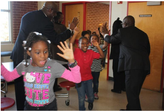
Assistant U.S. Attorneys and Support Staff give high-fives to students as they enter their celebration for improved attendance, behavior and academic performance.