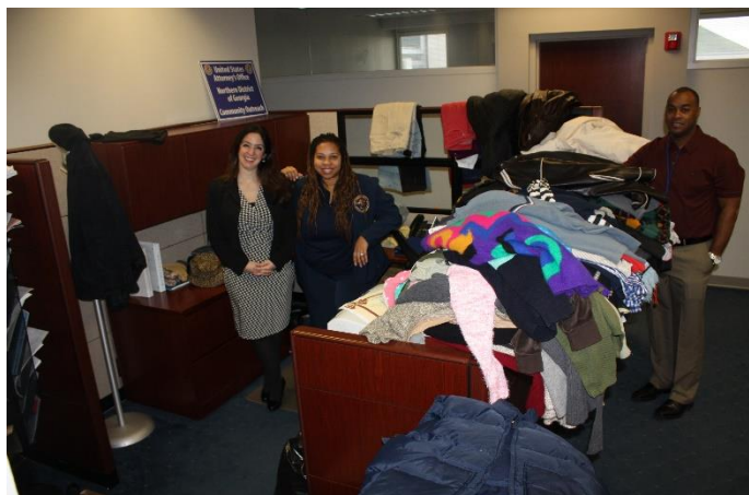
Community Outreach staff sorting winter clothing for Dismas clothing drive.

Community Outreach staff participated in two of the classes this year, focusing on overcoming barriers by establishing a support system and reconnecting with children during their period of incarceration.