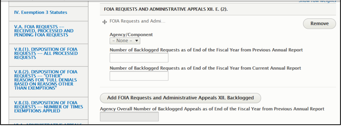
Screenshot of the FOIA.gov Annual Report Tool

Section XII.E.2: Comparison of Backlogged Administrative Appeals from Previous and Current Annual Report