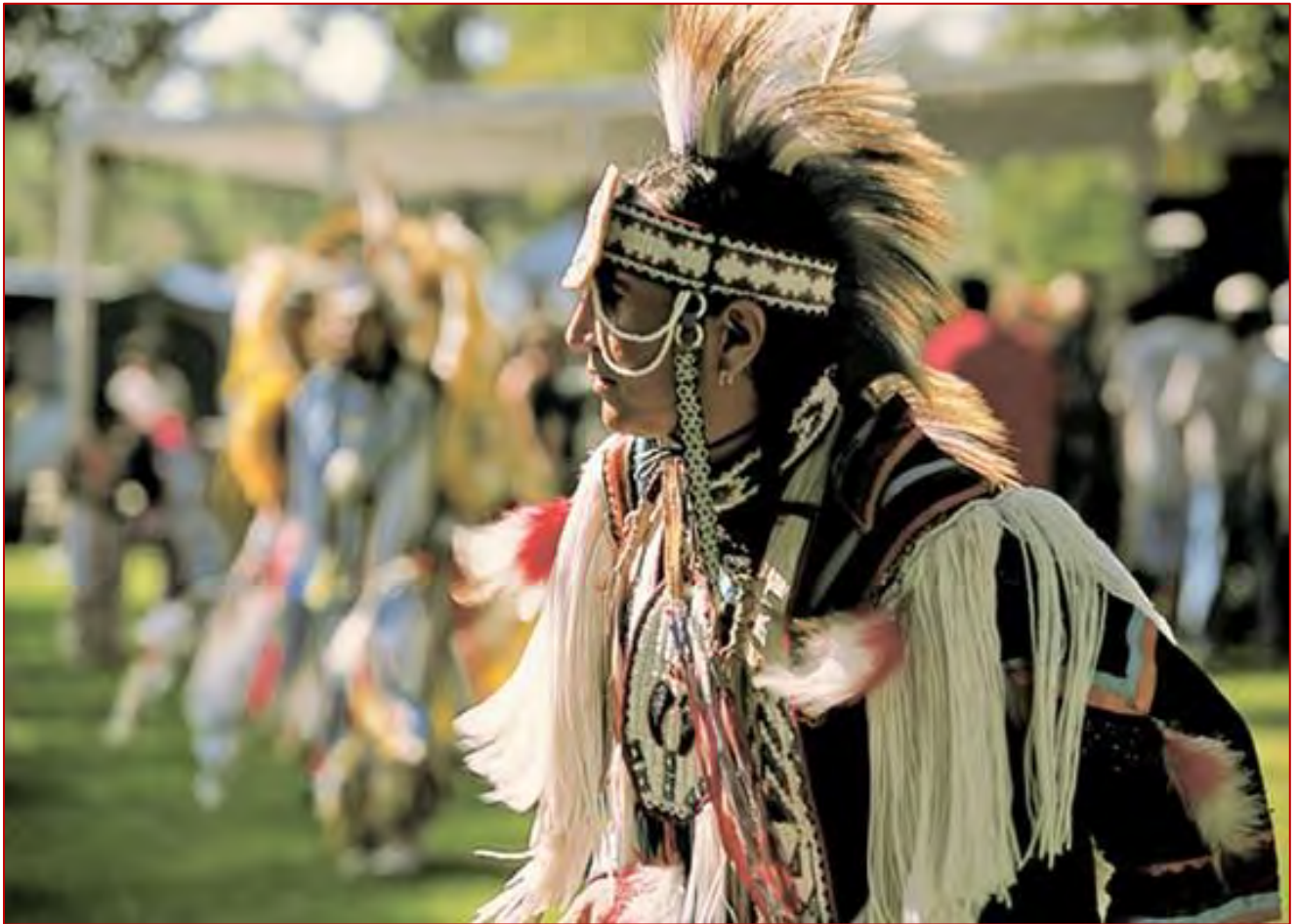
Macy Pow Wow